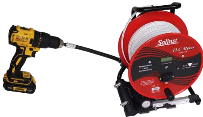
Solinst TLC Meter with Power Winder Installed to Make Temperature and Conductivity Profiling Applications Easier